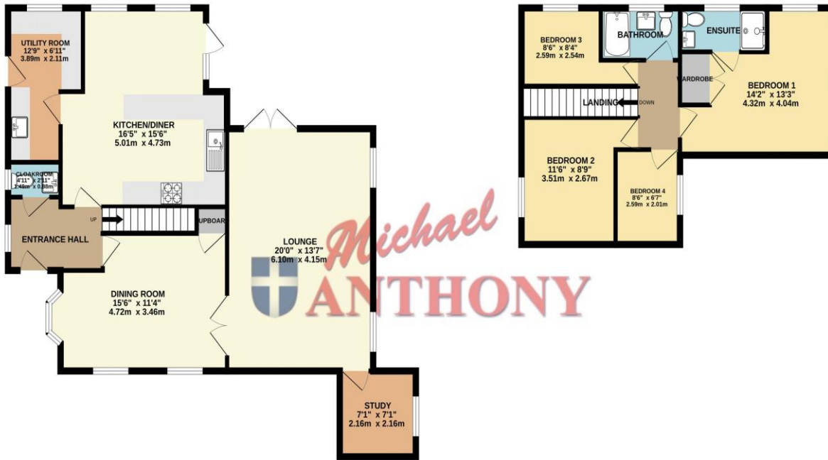
1ST FLOOR 463 sq.ft. (43.1 sq.m.) approx.

TOTAL FLOOR AREA : 1348 sq.ft. (125.2 sq.m.) approx.