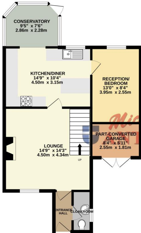
GROUND FLOOR 624 sq.ft. (58.0 sq.m.) approx.