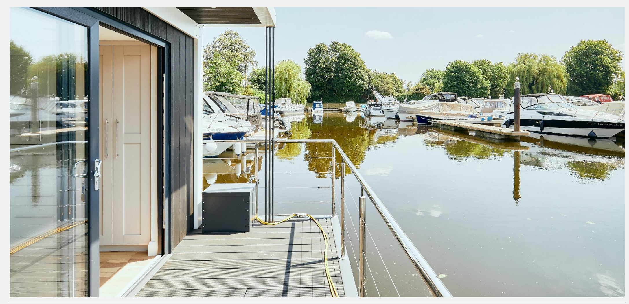
World Waterside Ltd trading as riverhomes for themselves and its clients give notice that 1: They are not authorised to make or give any representations or warranties in relation to the property either here or elsewhere, either on their own behalf or on behalf of their client or otherwise. 2: These particulars do not form part of any offer or contract and must not be relied upon as statements or representations of fact. Any areas, measurements or distances are approximate. The text, photographs and plans are for guidance only and are not necessarily comprehensive. 3: the should not be assumed that the property has all necessary planning, building regulation or other consents and any services, equipment of racilities have not been tested. 4: Lease details, service charges, ground rent (where applicable) and council tax are give any solution or other consents and any intending purchasers or tenants must satisfy themselves by inspection or otherwise as to the correctness of each of the statements or the particulars. If you require clarification of any points please contract us.