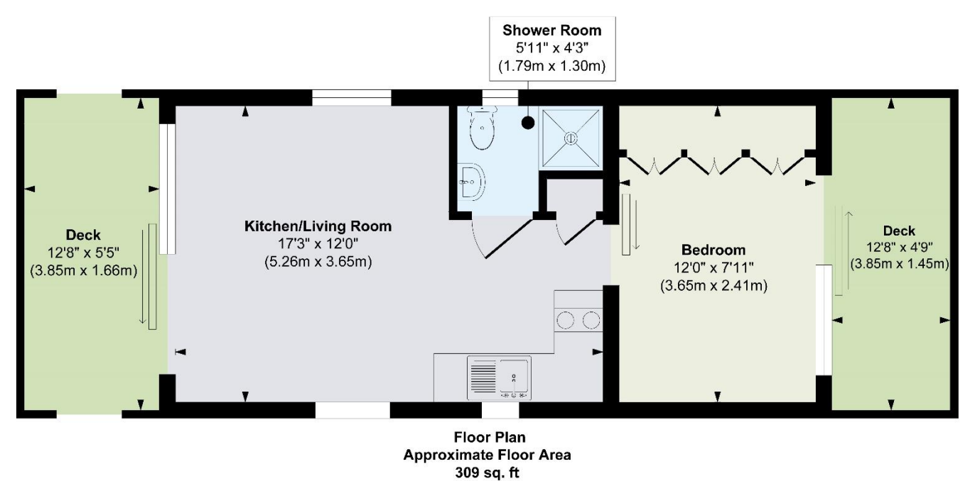
309 sq. ft (28.72 sq. m)