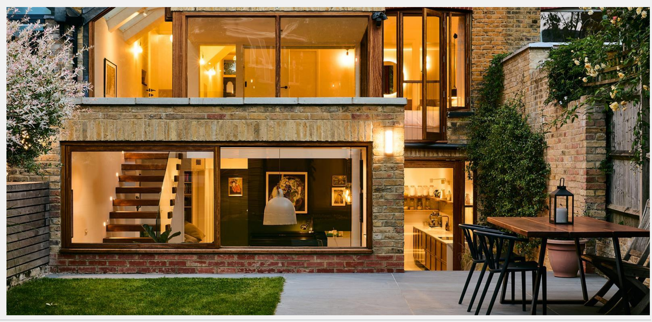
World Waterside Ltd trading as riverhomes for themselves and its clients give notice that 1: They are not authorised to make or give any representations or warranties in relation to the property either here or elsewhere, either on their own behalf or on behalf of their client or otherwise. 2: These particulars do not form part of any offer or contract and must not be relied upon as statements or representations of fact. Any areas, measurements or distances are approximate. The text, photographs and plans are for guidance only and are not necessarily comprehensive. 3: the should not be assumed that the property has all necessary planning, building regulation or other consents and any services, equipment or facilities have not been tested. 4: Lease details, service charges, ground rent (where applicable) and council tax are given as a guide only and intending purchasers or tenants must satisfy themselves by inspection or otherwise as to the correctness of each of the statements contained within these particulars. If you require clarification of any points please contact us.