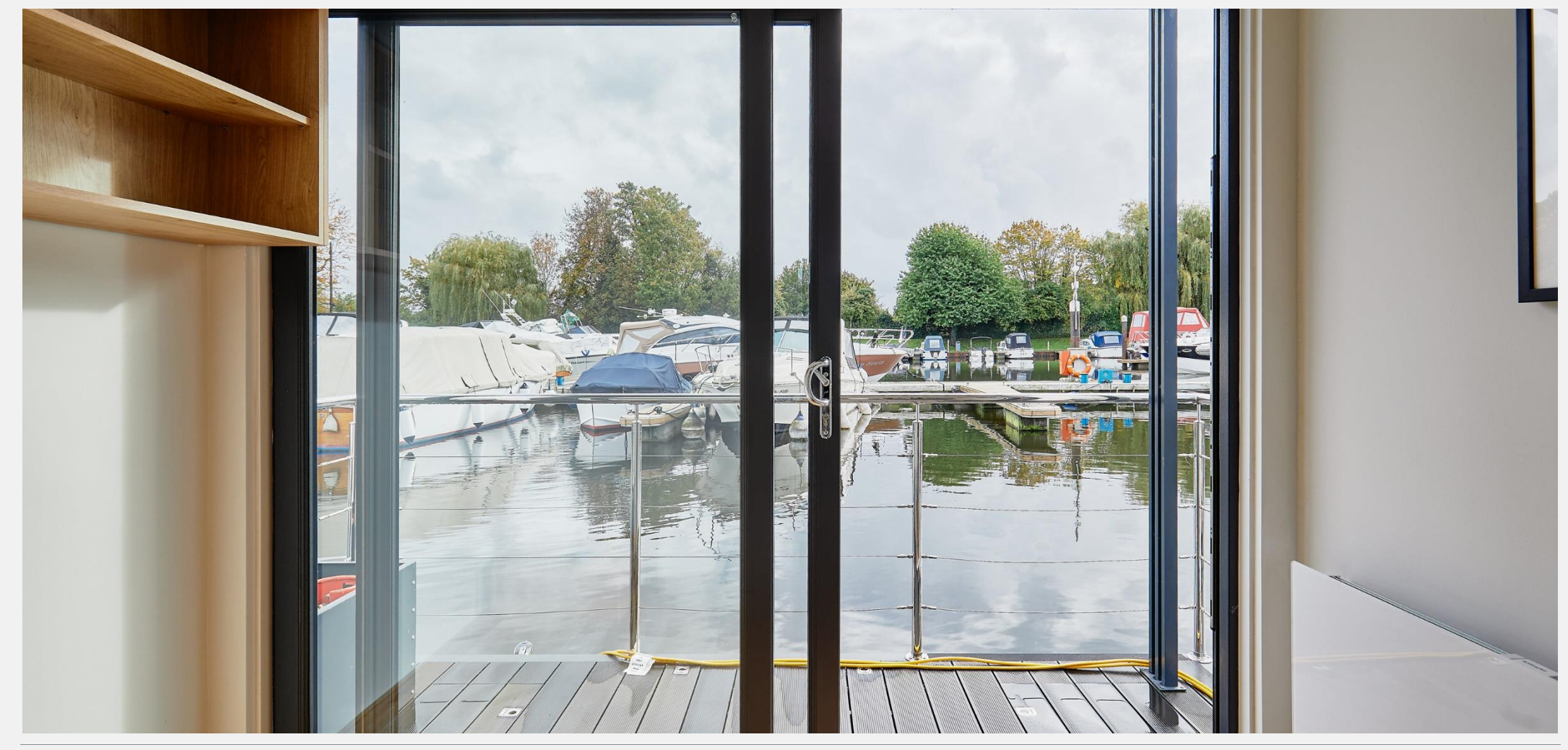
World Waterside Ltd trading as riverhomes for themselves and its clients give notice that 1: They are not authorised to make or give any representations or warranties in relation to the property either here or elsewhere, either on their own behalf or on behalf of their client or otherwise. 2: These particulars do not form part of any offer or contract and must not be relied upon as statements or representations of fact. Any areas, measurements or distances are approximate. The text, photographs and plans are for guidance only and are not necessarily comprehed any services, equipment or facilities have not been tested. 4: Lease details, service charges, ground rent (where applicable) and council tax are given as a guide only and should be chereful by your Solicitor prior to exchange of contracts. 5: They assume no responsibility and any intending purchasers or tenants must satisfy themselves by inspection or otherwise as to the correctness of each of the statements or the statements or the property either nere or elsewhere, either on their own behalf or on behalf or on behalf or on behalf or on behalf or on behalf or on behalf or on behalf or on behalf or on behalf or on behalf or on behalf or on behalf or on behalf or on behalf or on behalf or on behalf or on behalf or on behalf or on behalf or on behalf or on behalf or on behalf or on behalf or on behalf or on behalf or on behalf or on behalf or on behalf or on behalf or on behalf or on behalf or on behalf or on behalf or on behalf or on behalf or on behalf or on behalf or on behalf or on behalf or on behalf or on behalf or on behalf or on behalf or on behalf or on behalf or on behalf or on behalf or on behalf or on behalf or on behalf or on behalf or on behalf or on behalf or on behalf or on behalf or on behalf or on behalf or on behalf or on behalf or on behalf or on behalf or on behalf or on behalf or on behalf or on behalf or on behalf or on behalf or on behalf or on behalf or on behalf or on behalf or on behalf or on behalf or on behalf or on behalf or on