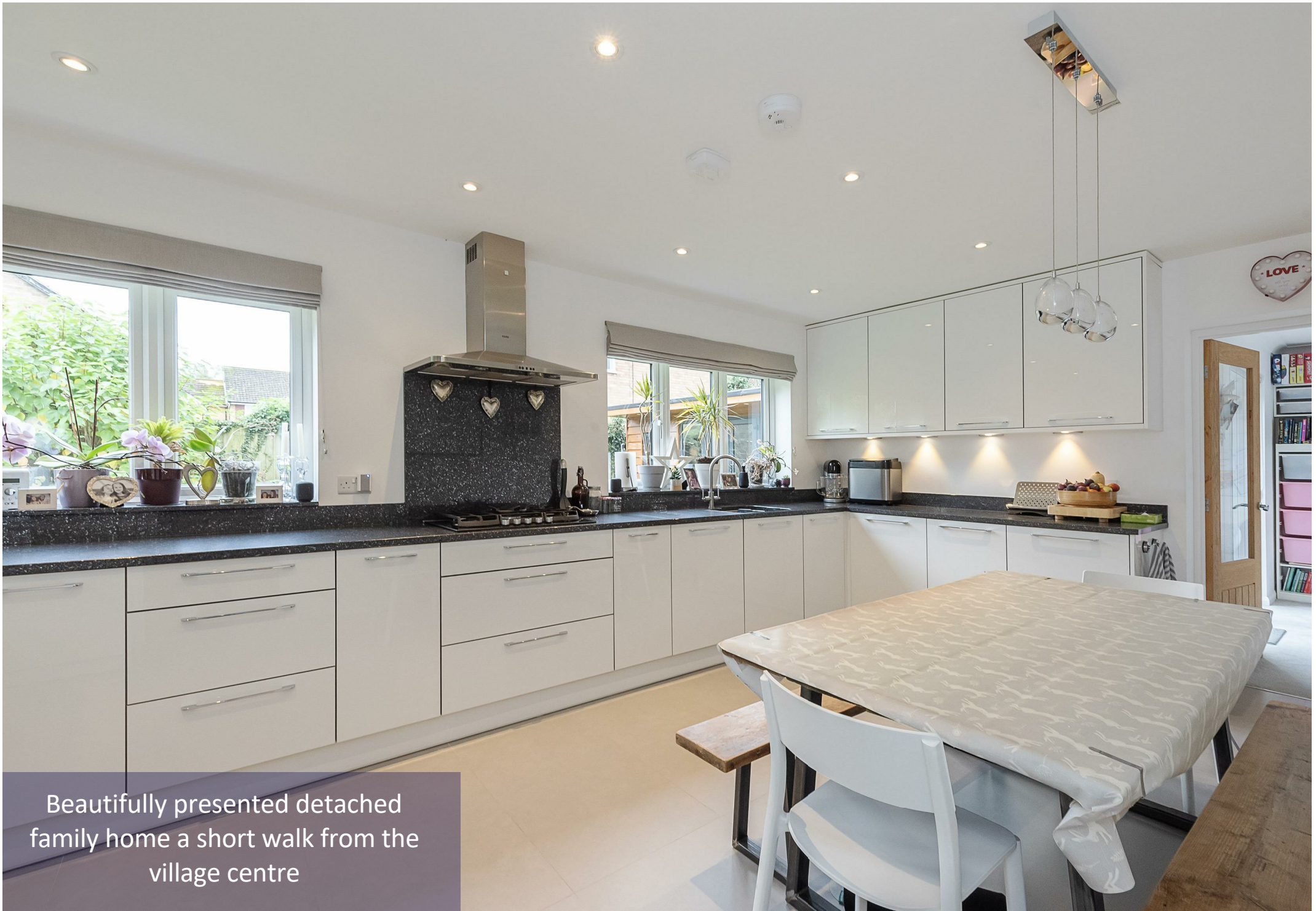
Beautifully presented detached family home a short walk from the village centre