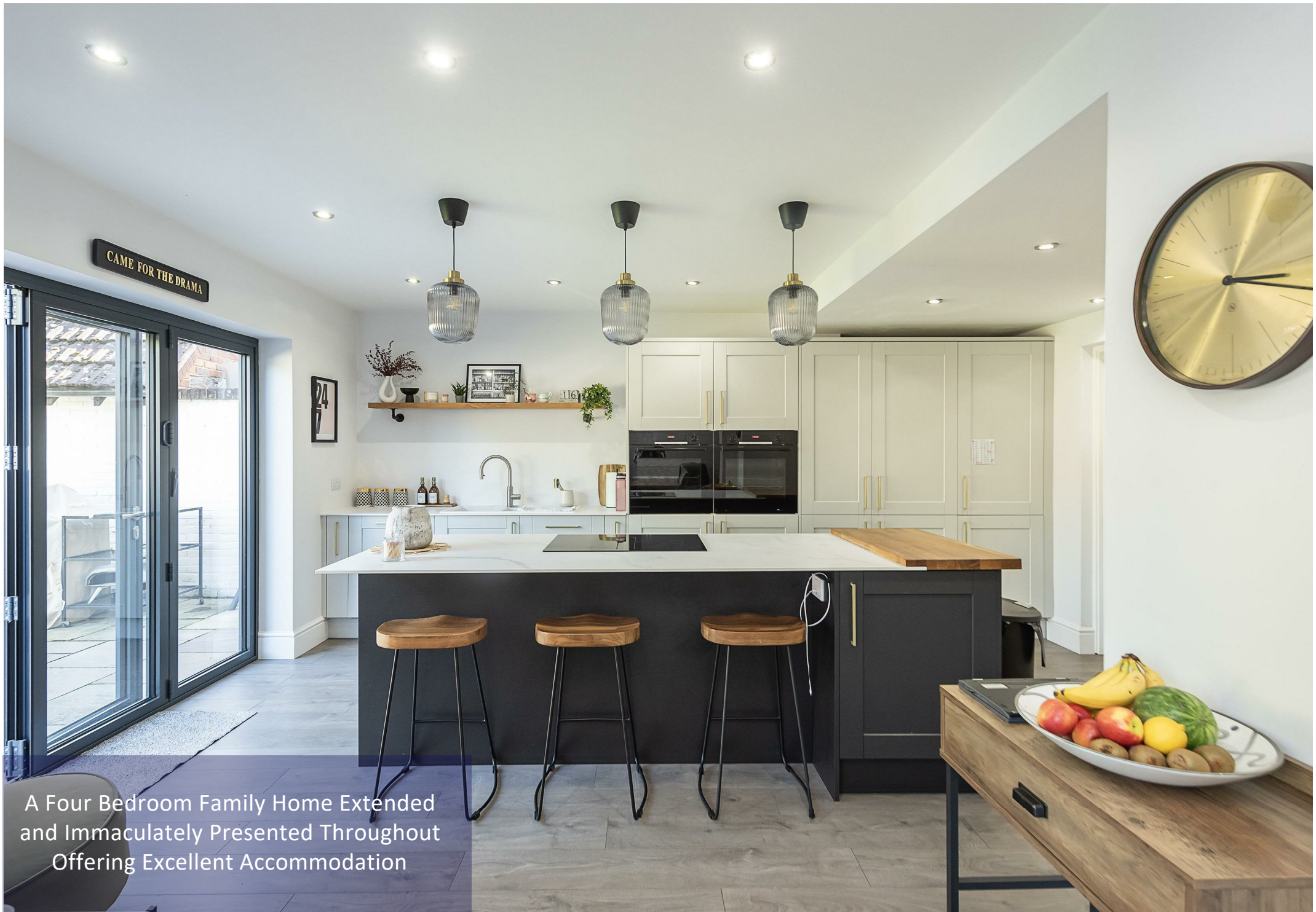
A Four Bedroom Family Home Extended and Immaculately Presented Throughout Offering Excellent Accommodation