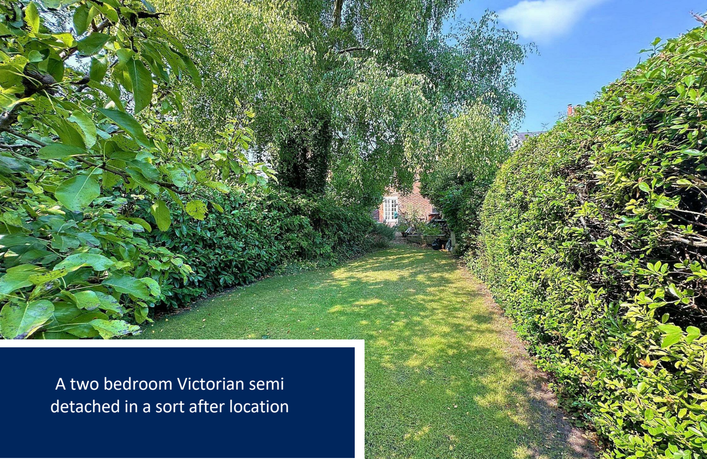
A two bedroom Victorian semi detached in a sort after location