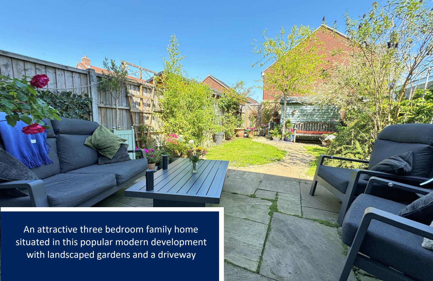
An attractive three bedroom family home situated in this popular modern development with landscaped gardens and a driveway