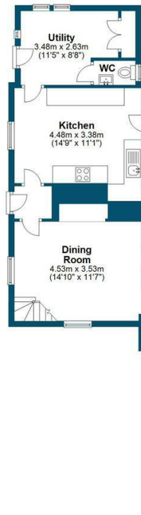
Ground Floor Approx. 85.2 sq. metres (916.8 sq. feet)