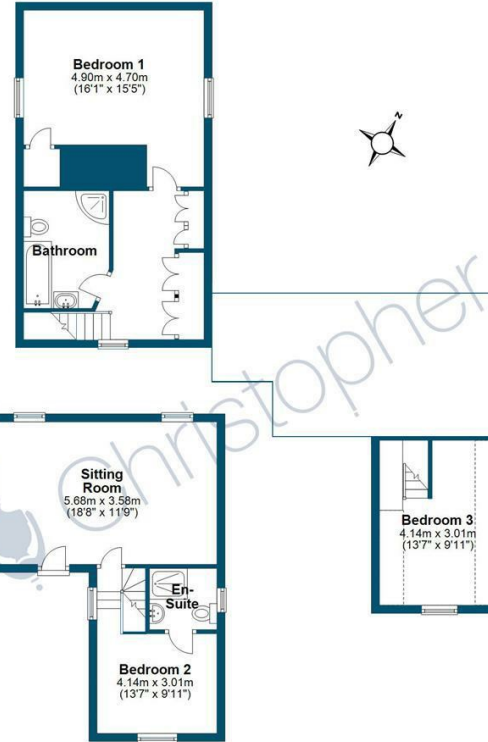
First Floor Approx. 49.9 sq. metres (537.6 sq. feet)