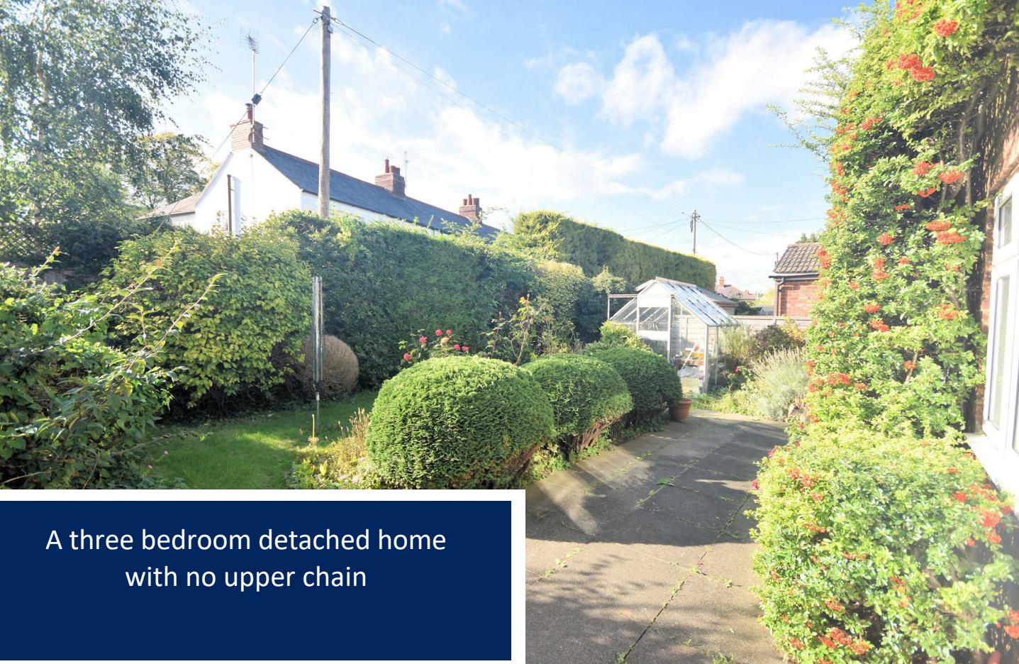
A three bedroom detached home with no upper chain