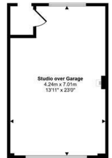
Studio Approx 31 sq m / 333 sq ft

This floorplan is only for illustrative purposes and is not to scale. Measurements of rooms, doors, windows, and any items are approximate and no responsibility is taken for any error, omission or mis-statement. Icons of items such as bathroom suites are representations only and may not look like the real items. Made with Made Snappy 360.