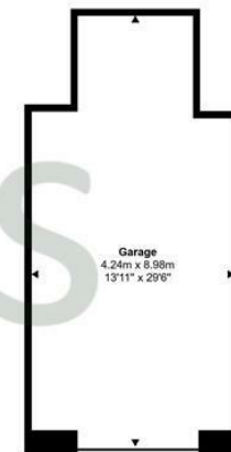
Garage Approx 34 sq m / 369 sq ft