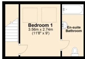
Ground Floor Approx. 50.9 sq. metres (548.1 sq. feet)

Living Room 3.53m x 4.01m (11'7" x 13'2")