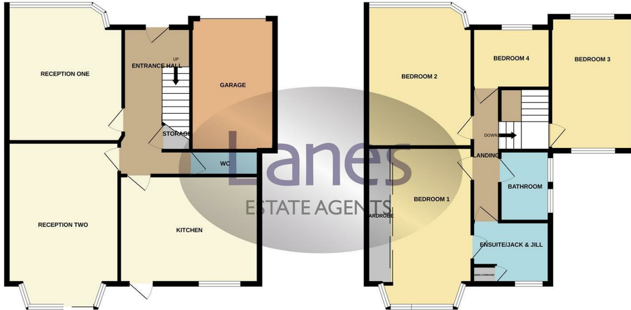
1ST FLOOR 720 sq.ft. (66.9 sq.m.) approx.

TOTAL FLOOR AREA : 1545 sq.ft. (143.5 sq.m.) approx.