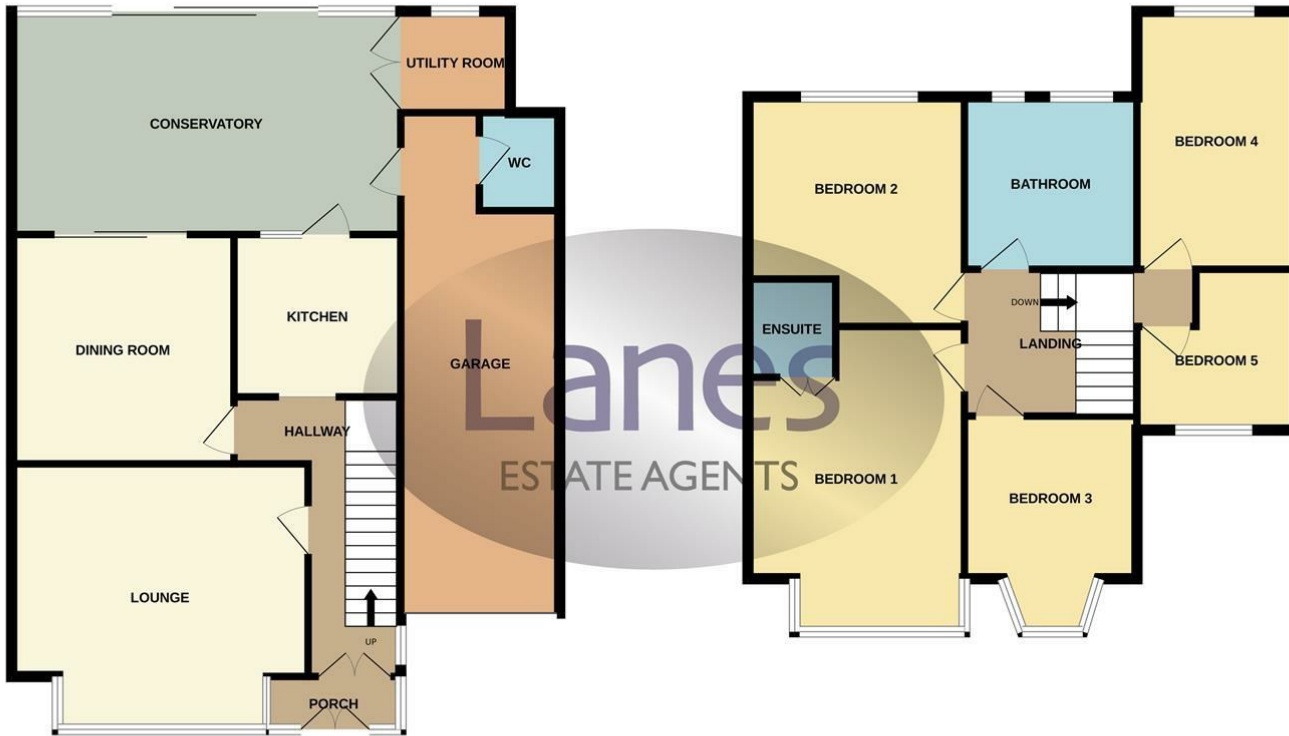
TOTAL FLOOR AREA: 1735 sq.ft. (161.2 sq.m.) approx.

Whilst every attempt has been made to ensure the accuracy of the floorplan contained here, measurements of doors, windows, rooms and any other items are approximate and no responsibility is taken for any error, omission or mis-statement. This plan is for illustrative purposes only and should be used as such by any prospective purchaser. The services, systems and appliances shown have not been tested and no guarantee as to their operability or efficiency can be given. Made with Metropix ©2024