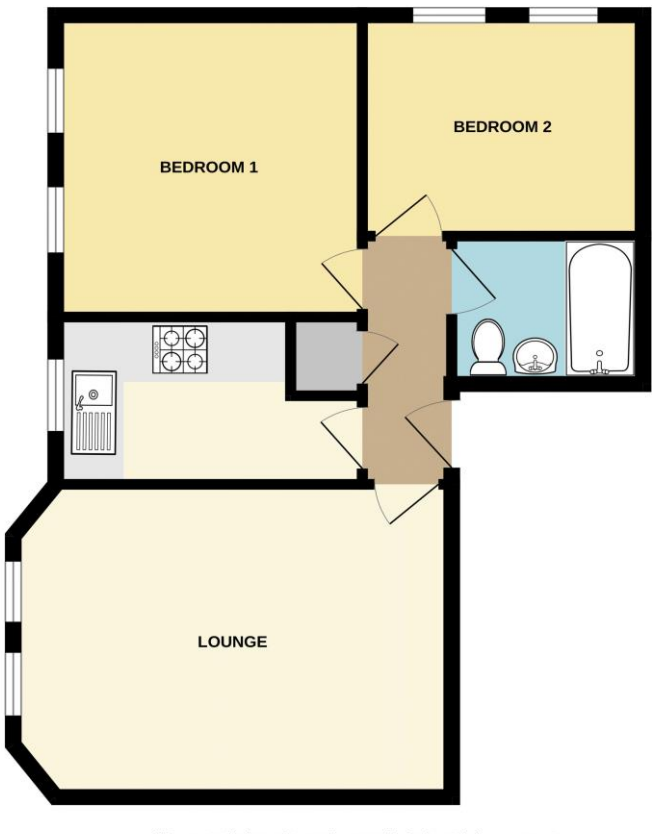
Whilst every attempt has been made to ensure the accuracy of the floorplan contained here, measurement of doors, windows, nooms and any other leters are approximate and no responsibility to skern for any error, omission or mis-statement. This plan is for illustrative purposes only and should be used as such by any prospective purchaser. The services, systems and appliances shown have not been tested and no guarante as to their operations or efficiency can be given.