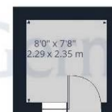
Ground Floor Building 3