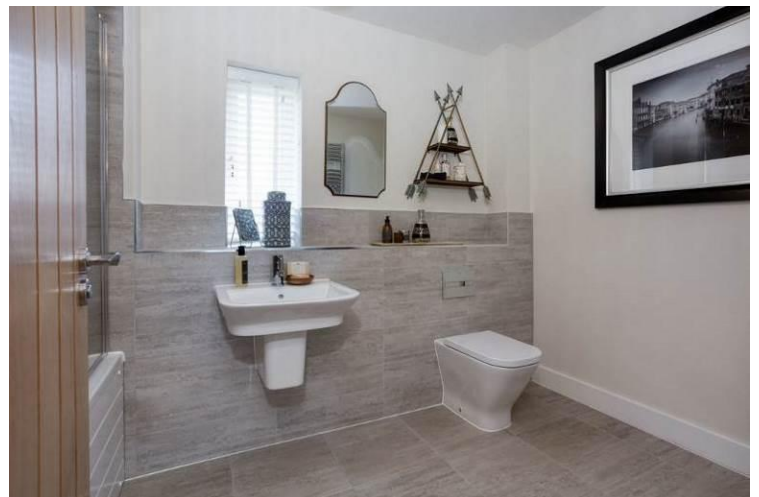
All internal photos are of the 'Barrington' showhome to give example of finish and specification