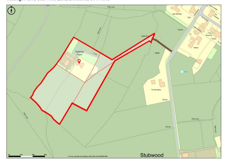
Promap © Crown Plotted Sc