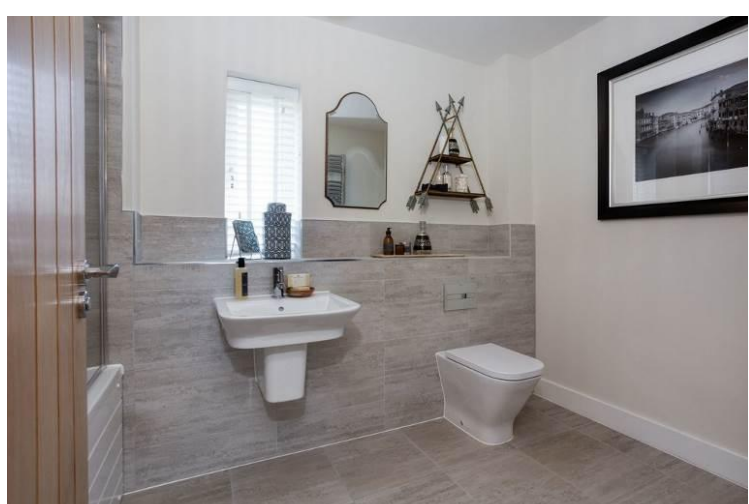
Internal photos are of the 'Barrington' showhome