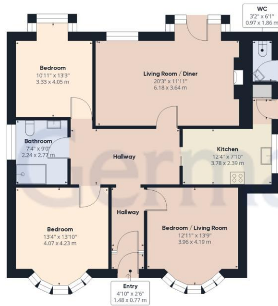
Ground Floor Building 1