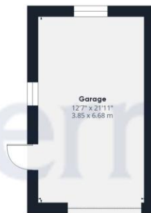
Ground Floor Building 2