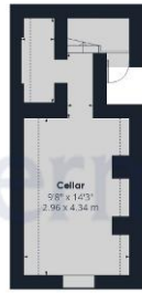
Floor -1 Building 1