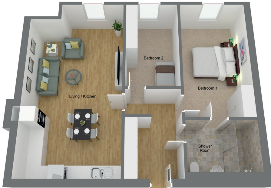
Illustration for identification purposes only. measurements are approximate. not to scale.