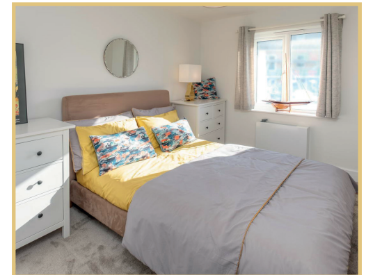
*photo depicts example of show bungalow