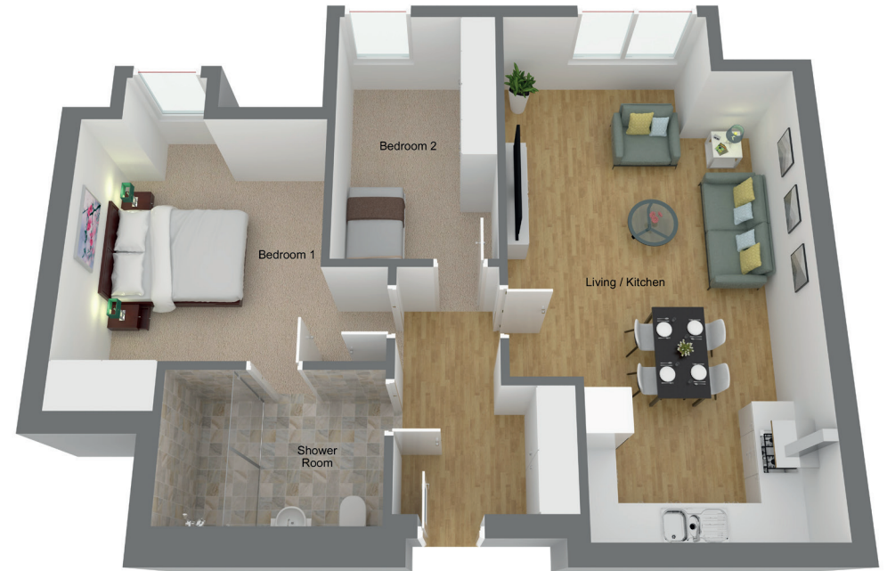
Illustration for identification purposes only. measurements are approximate. not to scale.