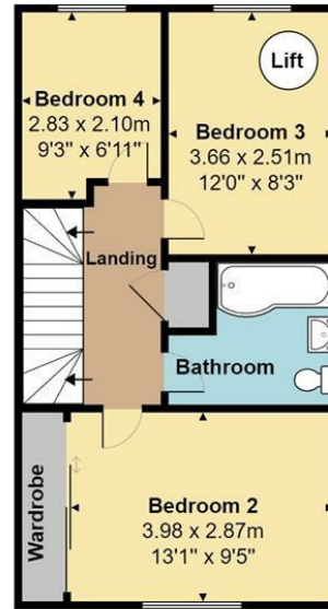
1st Floor Total Floor Area 42.0 m 2 ... 452 ft 2