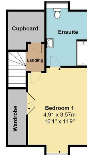
2nd Floor Total Floor Area 37.0 m 2 ... 398 ft 2

Measurements are approximate, not to scale and for illustrative purposes only. www.essentialpropertymarketing.com