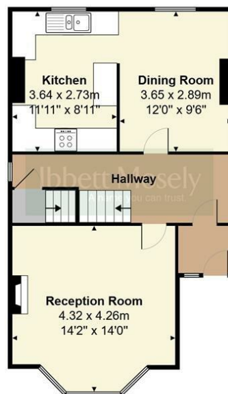
Ground Floor Total Floor Area 50.9 m 2 ... 548 ft 2