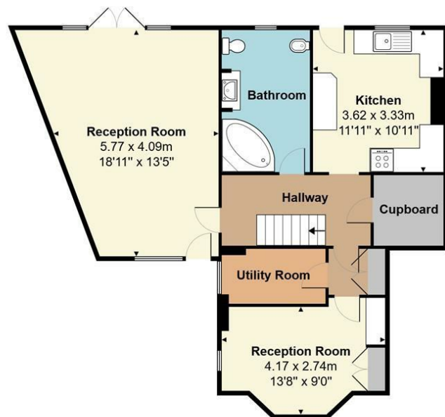
Lower Ground Floor Total Floor Area 72.0 m 2 ... 775 ft 2

Total Floor Area: 184.0 m 2 ... 1981 ft 2