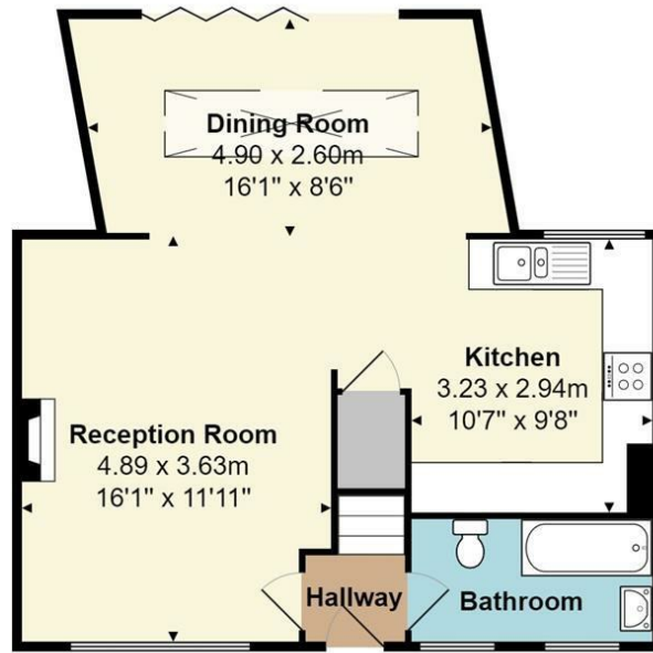
Ground Floor Total Floor Area 50.7 m 2 ... 545 ft 2