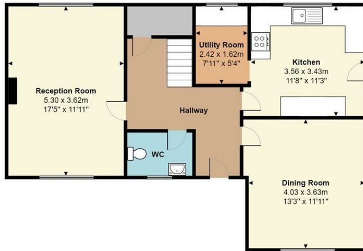
Ground Floor Total Floor Area 67.4 m 2 ... 726 ft 2

Total Floor Area: 149.2 m 2 ... 1606 ft 2