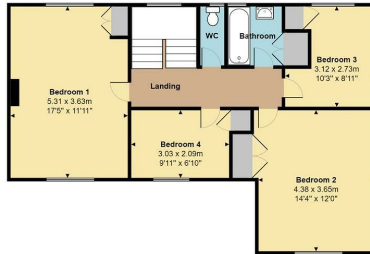
1st Floor Total Floor Area 68.2 m 2 ... 734 ft 2