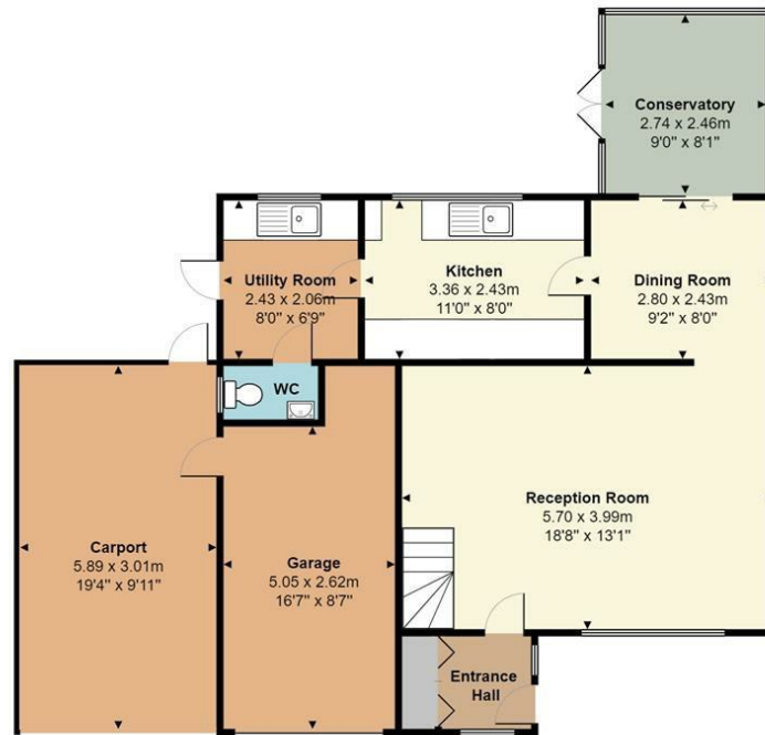
Ground Floor Total Floor Area 69.8 m 2 ... 751 ft 2

Total Floor Area: 125.4 m 2 ... 1350 ft 2 (Excluding Carport)