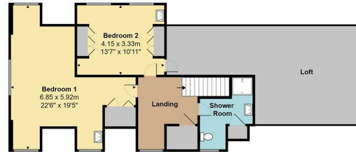
1st Floor Total Floor Area 57.8 m 2 ... 622 ft 2