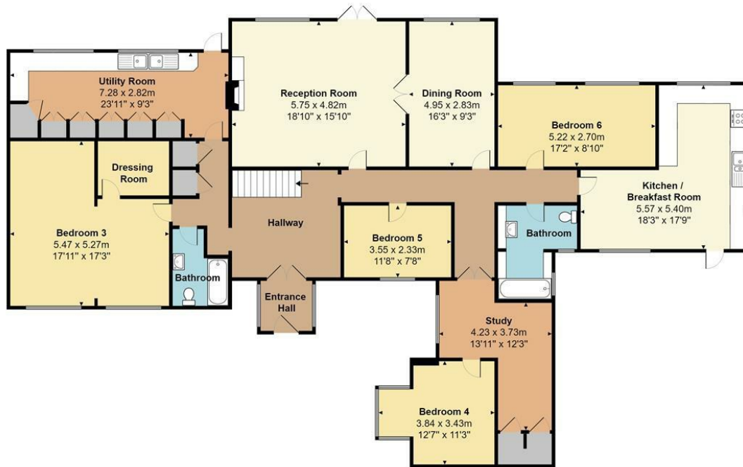
Ground Floor Total Floor Area 214.5 m 2 ... 2308 ft 2