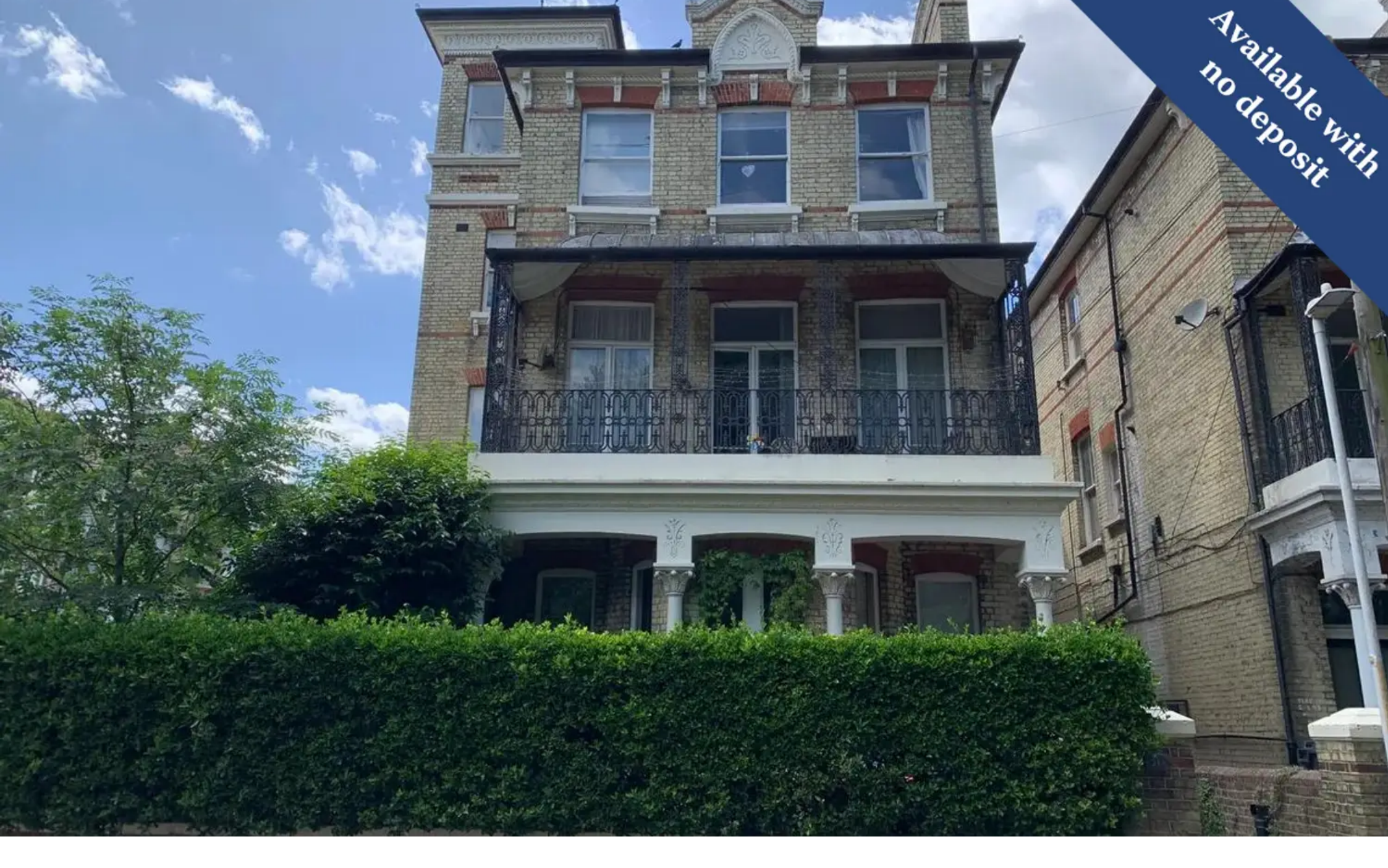
Flat 3, 21 Adrian Square, Westgate-On-Sea £1,200 pcm