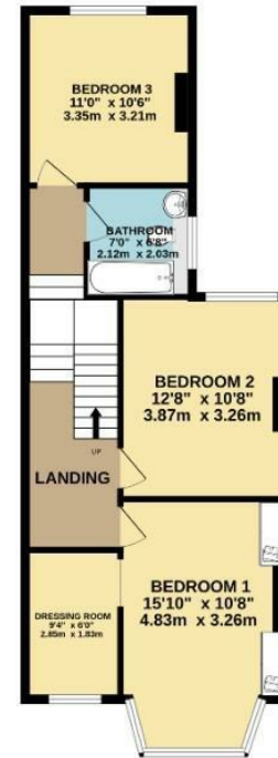
1ST FLOOR 635 sq.ft. (59.0 sq.m.) approx.