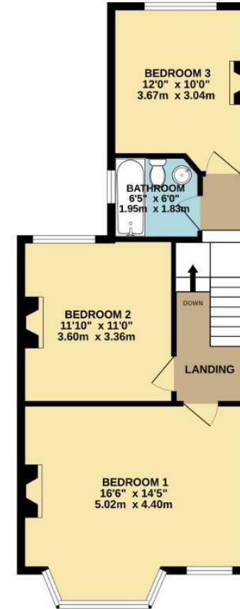
1ST FLOOR 576 sq.ft. (53.5 sq.m.) approx.