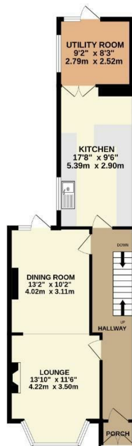
GROUND FLOOR 655 sq.ft. (60.9 sq.m.) approx.