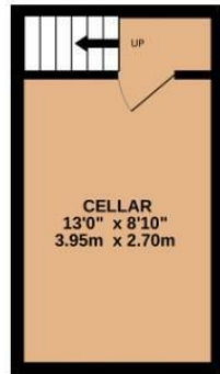
BASEMENT 140 sq.ft. (13.0 sq.m.) approx.