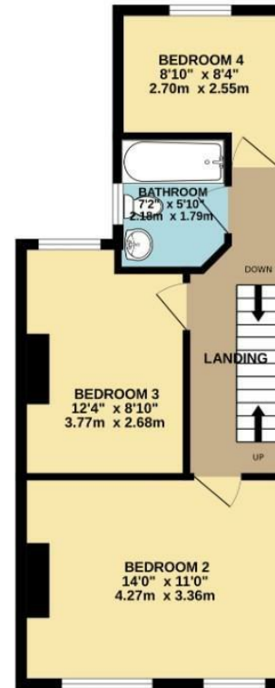
1ST FLOOR 430 sq.ft. (40.7 sq.m.) approx.