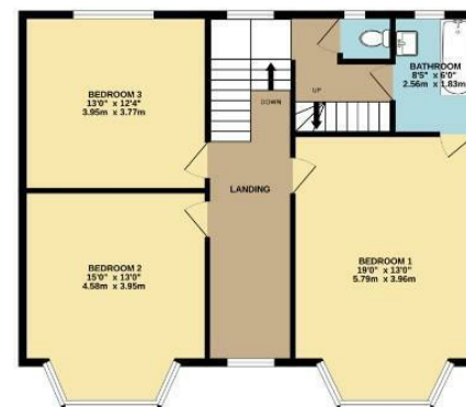
1ST FLOOR 828 sq.ft. (76.9 sq.m.) approx.