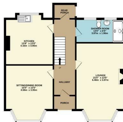
GROUND FLOOR 860 sq.ft. (79.9 sq.m.) approx.