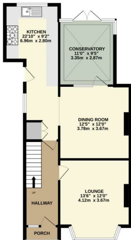
GROUND FLOOR 668 sq.ft. (62.1 sq.m.) approx.