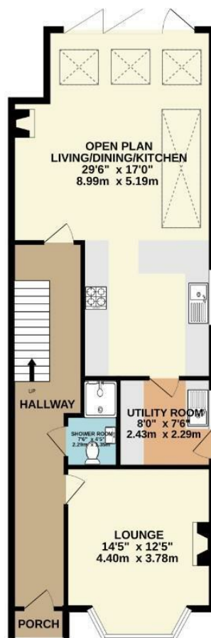
GROUND FLOOR 835 sq.ft. (77.6 sq.m.) approx.