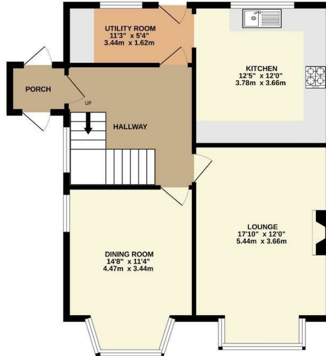
GROUND FLOOR 705 sq.ft. (65.5 sq.m.) approx.