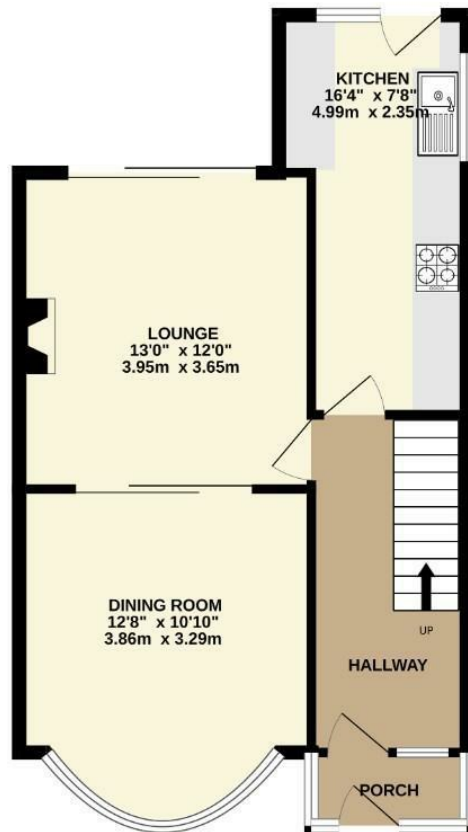
GROUND FLOOR 525 sq.ft. (48.8 sq.m.) approx.