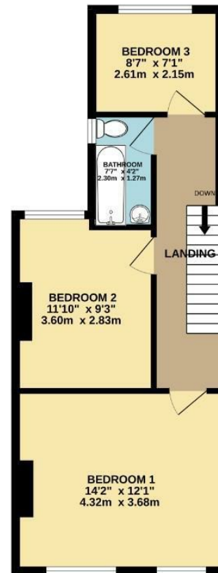
1ST FLOOR 457 sq.ft. (42.5 sq.m.) approx.