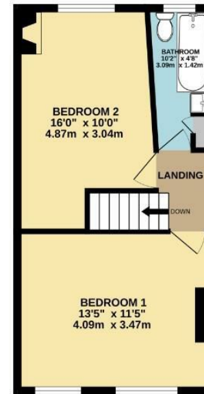
FIRST FLOOR 382 sq.ft. (35.5 sq.m.) approx.