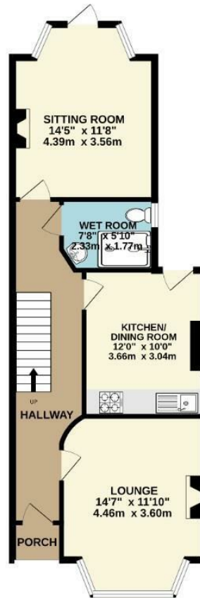
1ST FLOOR 621 sq.ft. (57.7 sq.m.) approx.