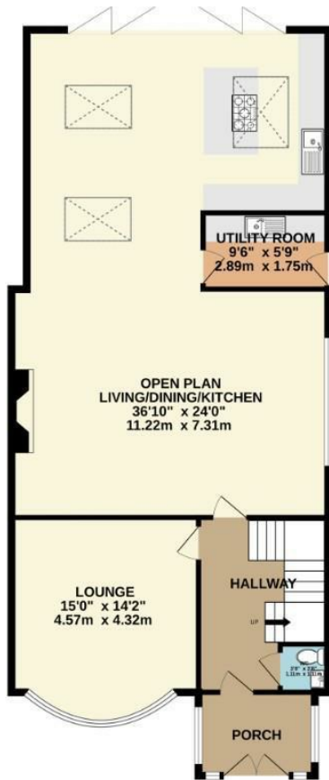
GROUND FLOOR 1250 sq.ft. (116.1 sq.m.) approx.