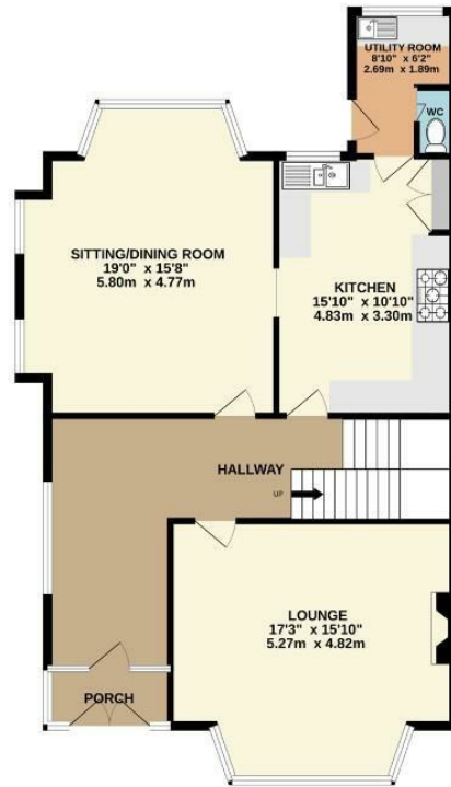
GROUND FLOOR 995 sq.ft. (92.4 sq.m.) approx.