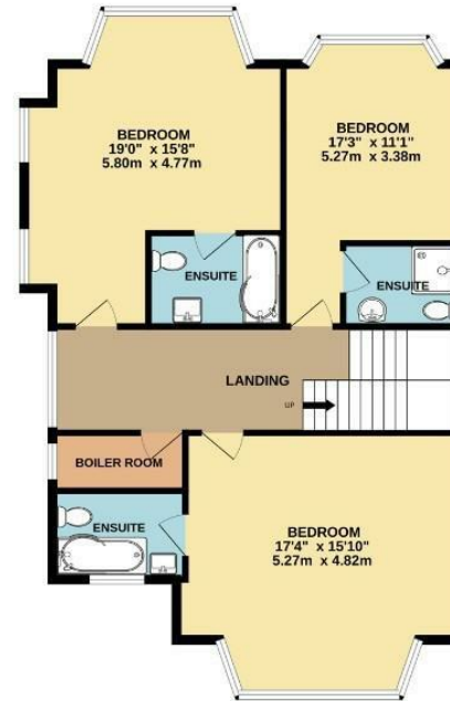
1ST FLOOR 928 sq.ft. (86.2 sq.m.) approx.