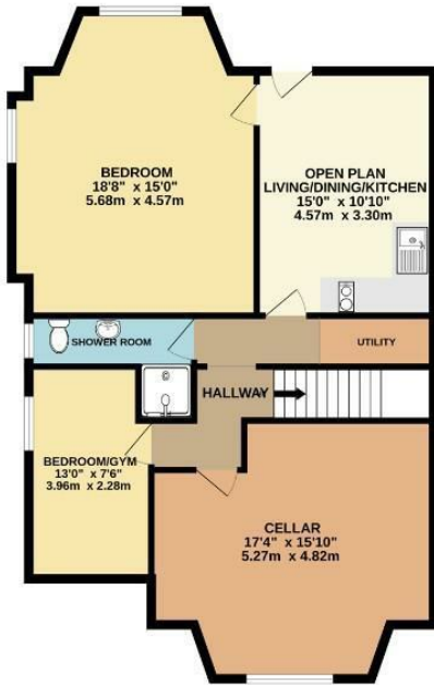
BASEMENT 901 sq.ft. (83.7 sq.m.) approx.