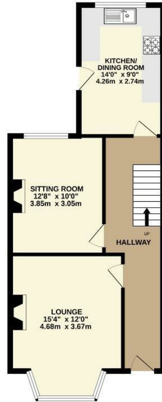
1ST FLOOR 527 sq.ft. (49.0 sq.m.) approx.