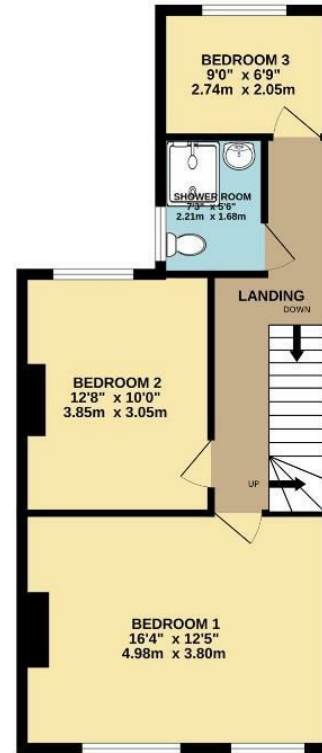
1ST FLOOR 527 sq.ft. (49.0 sq.m.) approx.