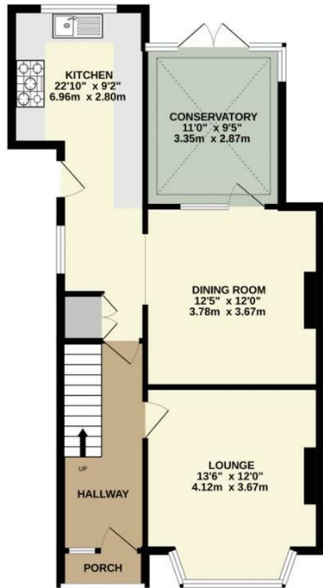
GROUND FLOOR 668 sq.ft. (62.1 sq.m.) approx.