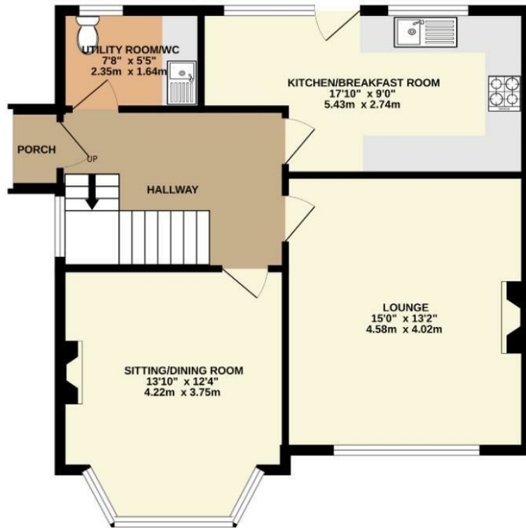
GROUND FLOOR 653 sq.ft. (60.7 sq.m.) approx.