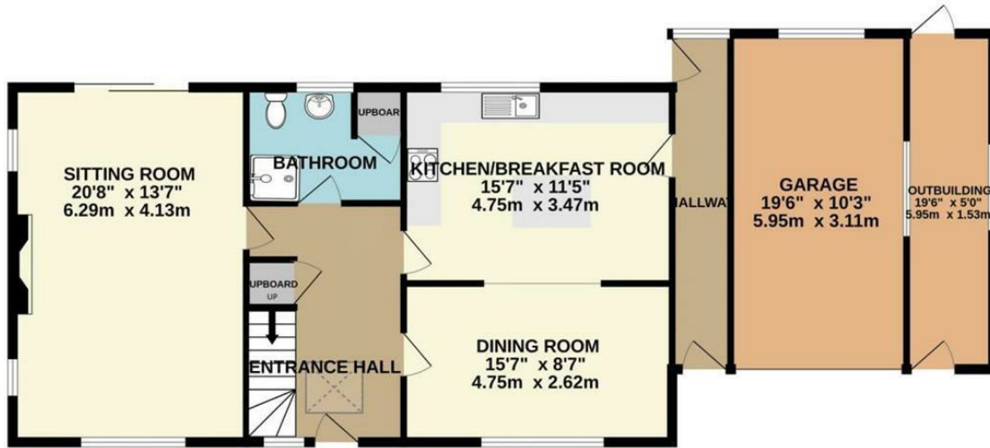
GROUND FLOOR 1148 sq.ft. (106.7 sq.m.) approx.